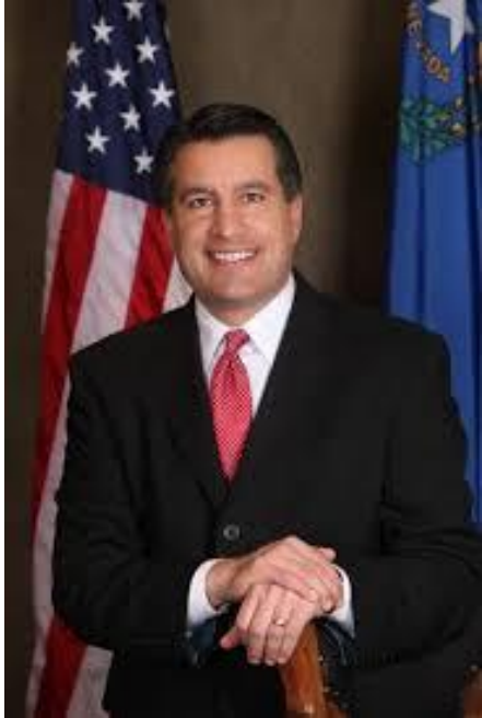
Gov. Brian Sandoval (R)