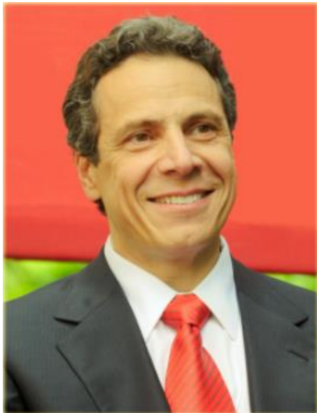
Governor Andrew Cuomo (D)