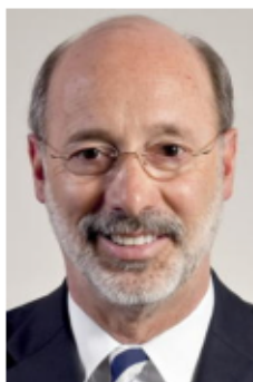
Gov. Tom Wolf (D)