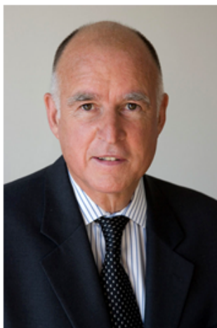
Gov. Jerry Brown (D)